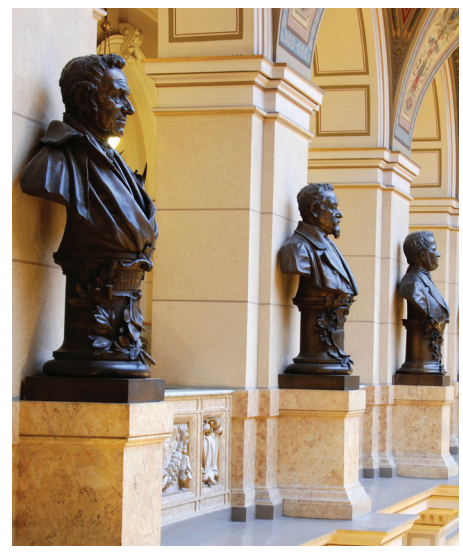
Our air filtration team understands that the requirements for preservation of our national and historic treasures differ for each application. Our experience in developing air filtration products for a variety of industries gives us the know-how to tackle any project.

Historical assets, such as this antique photo, can be effectively preserved with the proper filtration solutions in place.